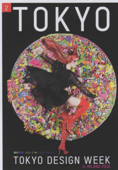
Tokyo Girl's Room by CHINTAI © Leslie Kee