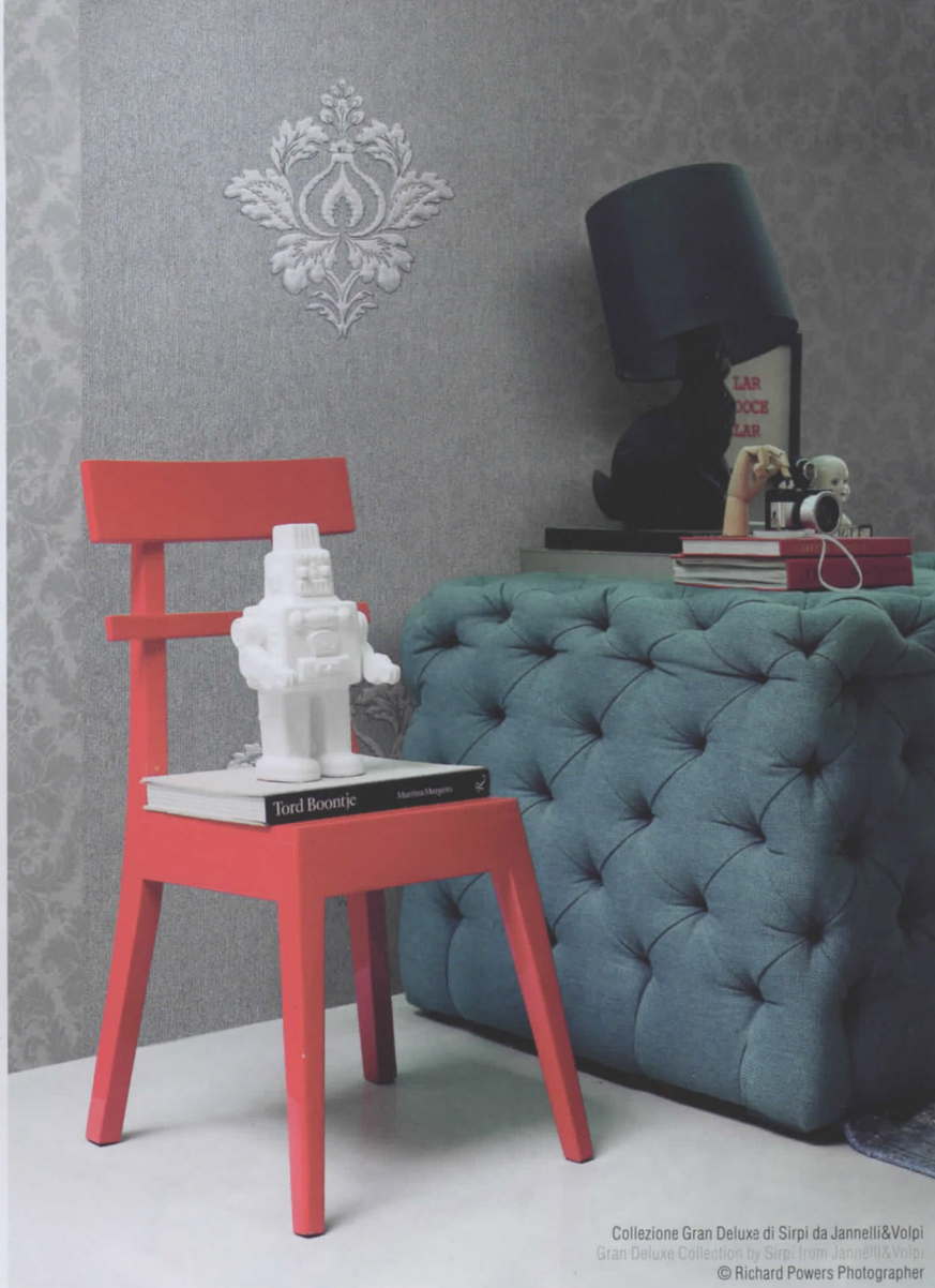
Collezione Gran Deluxa di Sirpi da Jannelli&Volpi Gran Deluxa Collection by Sirpi from Jannelli&Volpi.