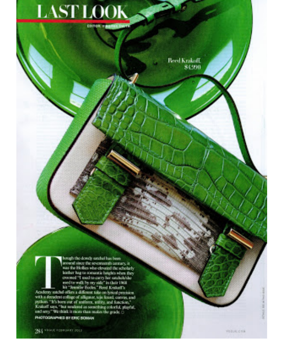
Vogue February 2013

I'm seeing green items, traditional and contemporary, in all of the magazines. This Samuel & Sons trim would liven up pillows or curtains.