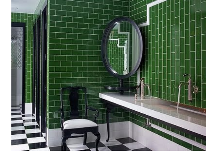
Three images above are from Modern Glamour: The Art of Unexpected Style, by Kelly Wearstler (Regan Books, 2004)

Kelly green is such a cheerful color, soothing yet vibrant and full of life. It can bring any interior palette to life. I have been using green for years and probably will for many more. One of my design projects from a few years back (pictured below) looks as fresh today as it was back then.